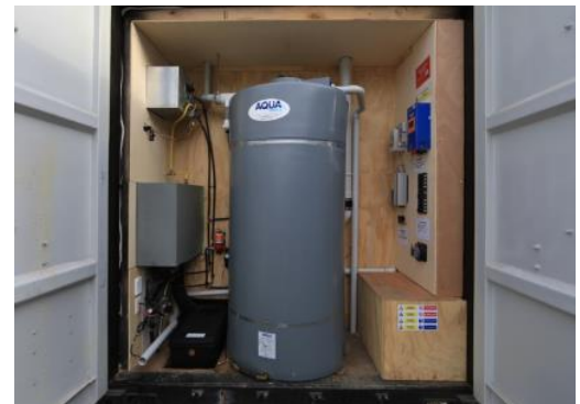
Utilities cupboard in end of container. Contains 1000L water tank, pump and accumulator tank, first flush diverter, grey water filter system and pump, gas bottles, water heater, batteries, solar controller, inverter and electrical components.