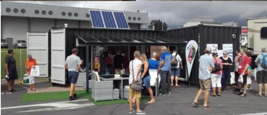
Great Barrier model on display along with 10m2 sleepout and awning. Covi Motorhome and Caravan show, ASB Showgrounds March 2017

This model is currently located in Pukekohe Email: brenda@iqcontainerhomes.co.nz